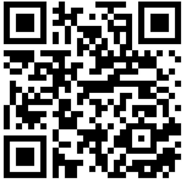
QR Code to Open Digilocker website in mobile