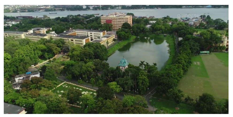
Main Academic and Acharya SN Bose Building

The Institute has a beautiful green campus covering an area of about 49hectares situated on the bank of the river Hooghly. It is located next to the AJC Bose Indian Botanical Garden and opposite to the Kolkata Port. The campus has a number of academic and administrative buildings, library, accommodations for staffs and students, guest house, auditorium, swimming pool, students' amenities, banks, school, hospitals and general services.