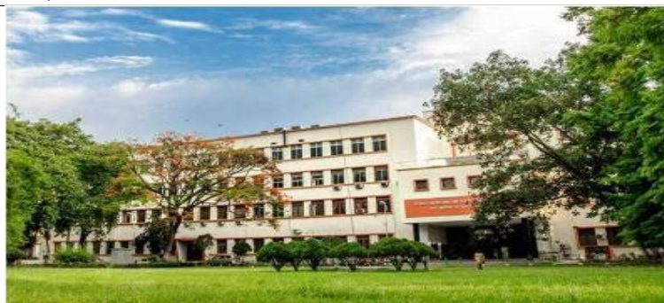
Main Academic Building